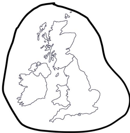
Car Storage somewhere within the black outline